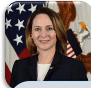
Dr. Kathleen Hicks