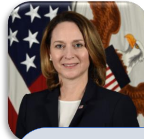
Dr. Kathleen Hicks