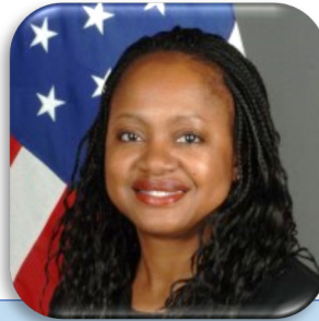
Ambassador Bonnie Jenkins