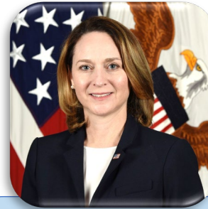
Dr. Kathleen Hicks