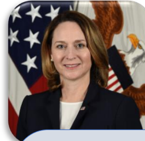
Dr. Kathleen Hicks